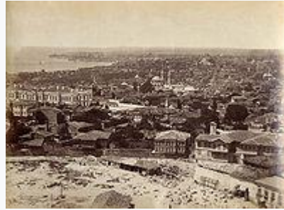
Abdullah Brothers and showing the Laleli Mosque and its surroundings before 1895 .