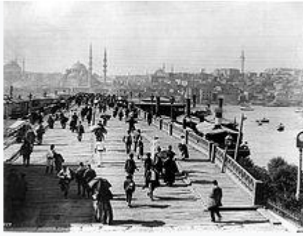
Galata Bridge and New Mosque in the late 19th century .