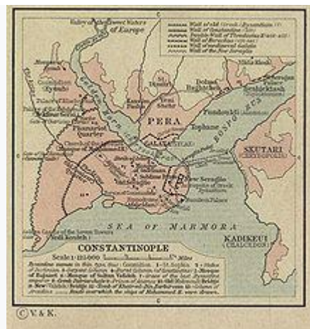
Istanbul in the Ottoman period

Istanbul has been among the world's largest and most important metropolises for sixteen centuries, from the 4th century to the 20th century . It has been the undisputed sole ruler of a large region where the continents of Europe, Asia and Africa intersect , and has managed to significantly affect world history in this process.