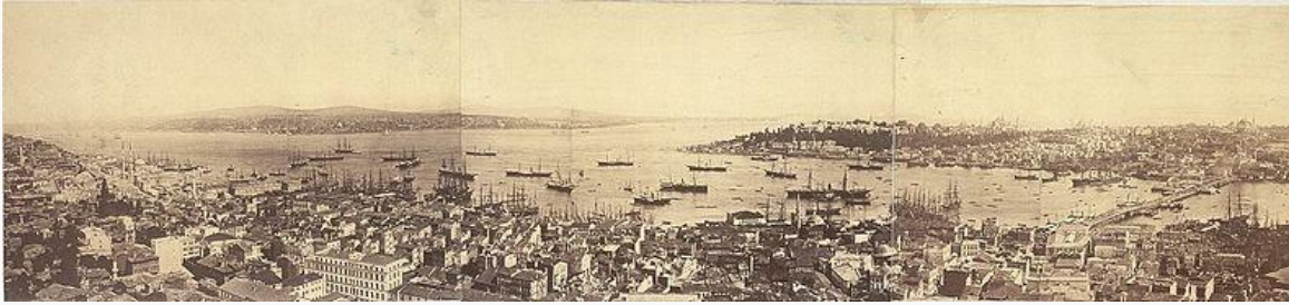
Panoramic view of Istanbul during the Ottoman Empire