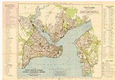
Map of Istanbul in 1922

In this period, Istanbul will be the capital of a great world empire, and it will dominate the lands spread over three continents for more than 400 years .